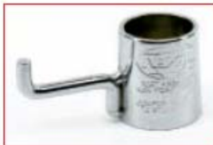
LARGE 1 1/2" SHELF COLLAR HOOK Model No. SSB2C