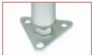
FOOT PLATE Model No. AF