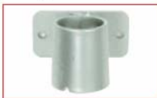
WALL MOUNTING BRACKET Model No. AW2C Secures posts to wall - 2" clearance.