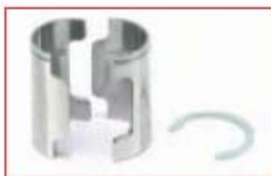
ALUMINUM SHELF CLIP WITH RETAINER RING Model No. AMA