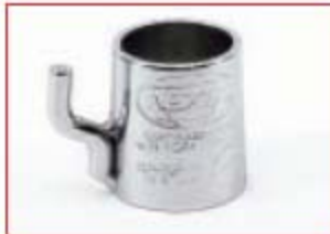
SMALL 1/2" SHELF COLLAR HOOK Model No. SSB1C