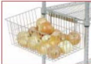
UTILITY BASKET Model No. ASW177 17 3/8" x 7 1/2" x 10"H.