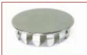
SHELF COLLAR PLUG Model No. AL Use on shelf collar.