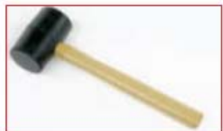
RUBBER Mallet Model No. ARM