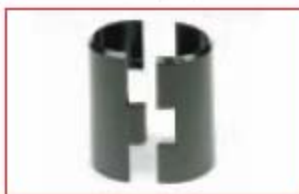
SHELF CLIP (4 PAIR) Model No. AM