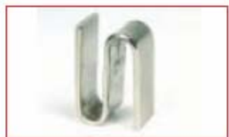
"S" HOOK Model No. AS - Use 2 for each add-on wire shelf. Sold 8 per package