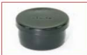
POST CAP Model No. AP Use on top of post.