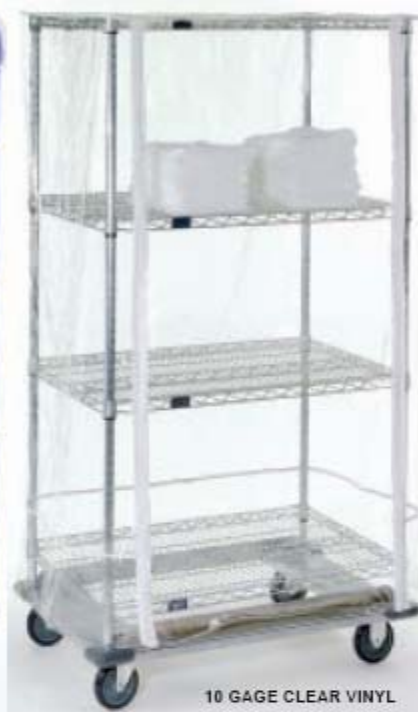
10 GAGE CLEAR VINYL

H elps keep contents dust and dirt free. Made of water resistant, 400 denier nylon or 10 gage vinyl with reinforced corners and double stitching for maximum durability. Velcro or zipper closure. Specify color suffix (RD) Red, (BL) Blue, (WH) White or (CL) Clear, when ordering. Special orders upon request.