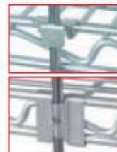
SIDE CLIP Model No. AT

E nclose back and/or sides of shelving easily with rods and clips. Each kit contains 1 rod, 4 front/back-clips (AT) and 4 side clips (SRT) that allow you to attach rods at desired spaces. Chrome finish.