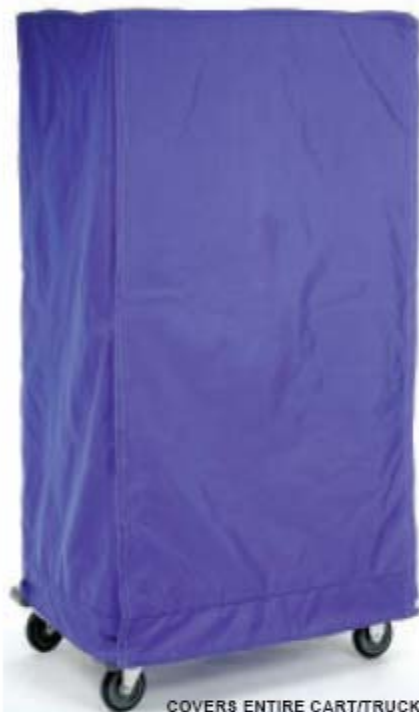
COVERS ENTIRE CART/TRUCK