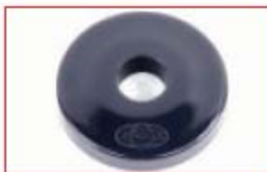
3 1/2" DONUT BUMPER Model No. AB3