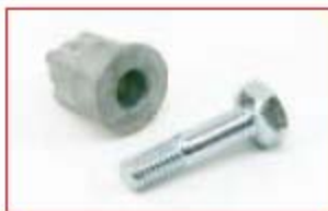
POST LEVELER BOLT & INSERT Model No. AX