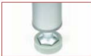
NON-MARRING FLOOR GLIDE Model No. AG