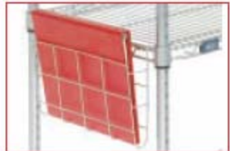
DOCUMENT HOLDER Model No. AH 12 3/8" x 2" x 6 5/8"H