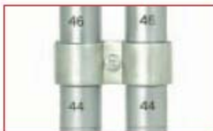
POST CLAMP Width* Model No. Securely joins two sections together. 1 1/16" AC 3 1/16" ACX