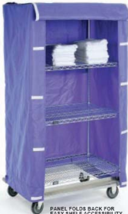
PANEL FOLDS BACK FOR EASY SHELF ACCESSIBILITY