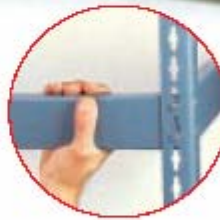
THREE SHELF UNIT- GRAY OR TAN FINISH