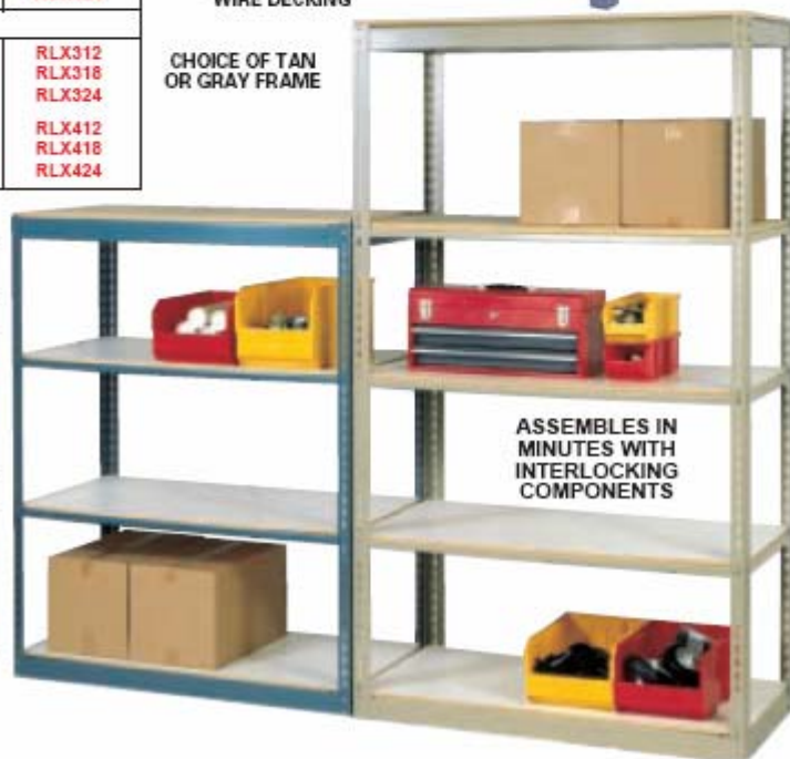
ASSEMBLES IN MINUTES WITH INTERLOCKING COMPONENTS