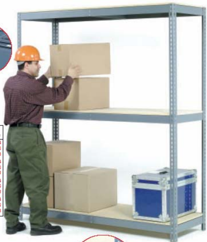
THREE SHELF UNIT- GRAY OR TAN FINISH