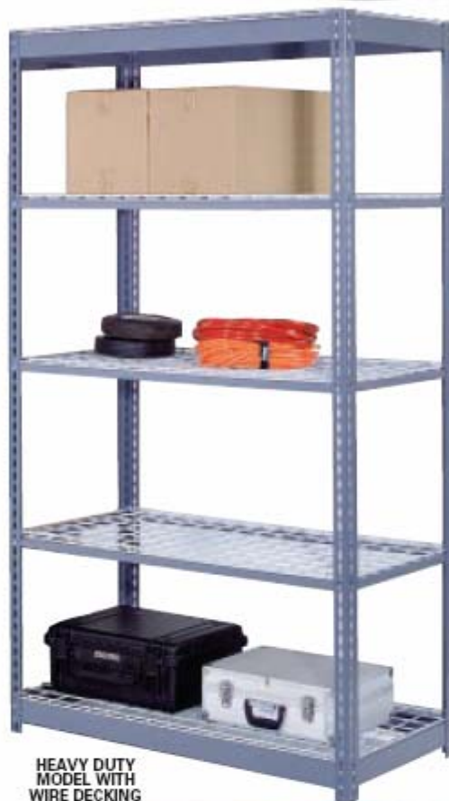
HEAVY DUTY MODEL WITH WIRE DECKING