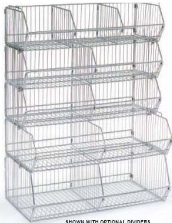
SHOWN WITH OPTIONAL DIVIDERS

A n easy access modular storage system that is both time and space efficient. Full view open design provides inventory control at a glance. Position side-by-side or back-to-back, stack 2 or 3 high for bench top use, stack up to 7 high for free-standing rack or use 14" and 20" deep lower bin with dolly for easy transport. Each bin has a 100 lb. capacity and can be separated into sub-compartments with dividers (sold separately). Industrial strength .283 dia. frame wire with .105 dia. cross wire construction ensures strength and rigidity, chrome finish. Assembles easily.