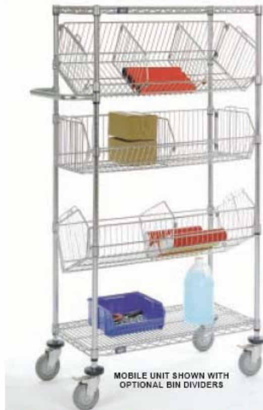
MOBILE UNIT SHOWN WITH OPTIONAL BIN DIVIDERS