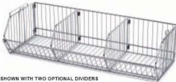
SHOWN WITH TWO OPTIONAL DIVIDERS

A n easy access modular storage system that is both time and space efficient. Full view open design provides inventory control at a glance. Position side-by-side or back-to-back, stack 2 or 3 high for bench top use, stack up to 7 high for free-standing rack or use 14" and 20" deep lower bin with dolly for easy transport. Each bin has a 100 lb. capacity and can be separated into sub-compartments with dividers (sold separately). Industrial strength .283 dia. frame wire with .105 dia. cross wire construction ensures strength and rigidity, chrome finish. Assembles easily.