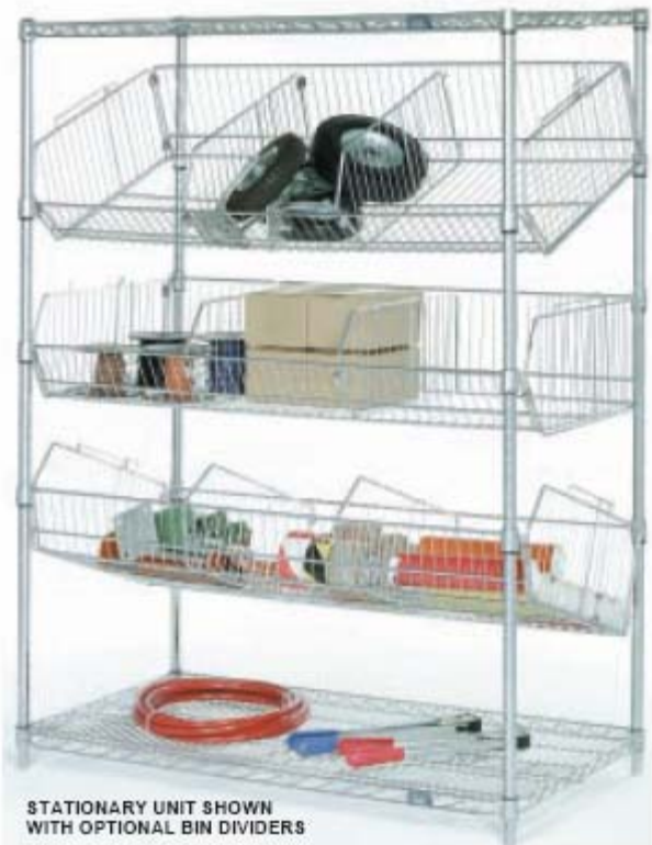
STATIONARY UNIT SHOWN WITH OPTIONAL BIN DIVIDERS

Angled Up: Provides maximum bin capacity.