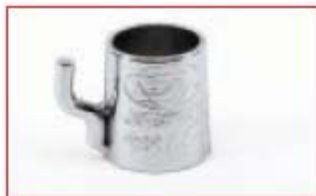
WIRE COLLAR HOOK SET