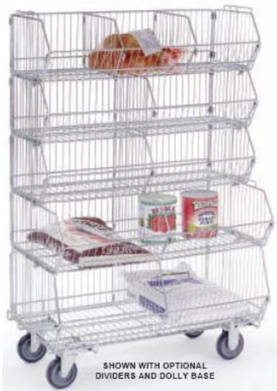
SHOWN WITH OPTIONAL DIVIDERS AND DOLLY BASE